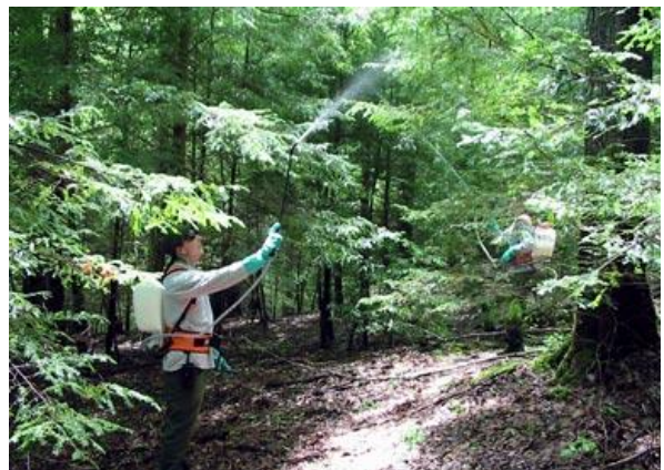
Low-pressure foliar application.

Foliar sprays of horticultural oil or insecticidal soap, when applied properly, have been shown to be effective while having a low toxicity to applicators and non-target organisms. They kill by suffocating soft-bodied insects like adelgids; it is essential to completely drench the infested foliage. The best times to spray are from April to May and August to mid-October. Different types of oils and soaps can burn foliage, so follow directions on the label. These materials don't provide long term protection; reapplication may be needed.