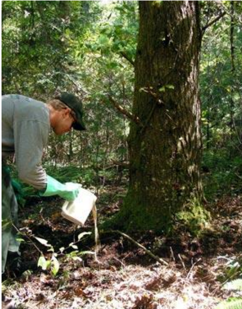
Soil drenching – a good option for homeowners.

For systemic treatments, insecticide is applied by soil injection, soil drenching, trunk injection, and trunk spray. Systemic treatments have a time lag before control begins. The rate of insecticide to use is determined by tree size. Systemic treatments are well suited for trees that are still healthy enough to have good water movement that will carry the material throughout the tree.